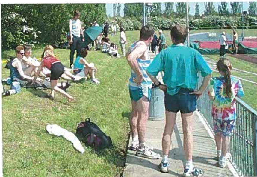
Club members enjoying the heat wave on this scorcher of a day.